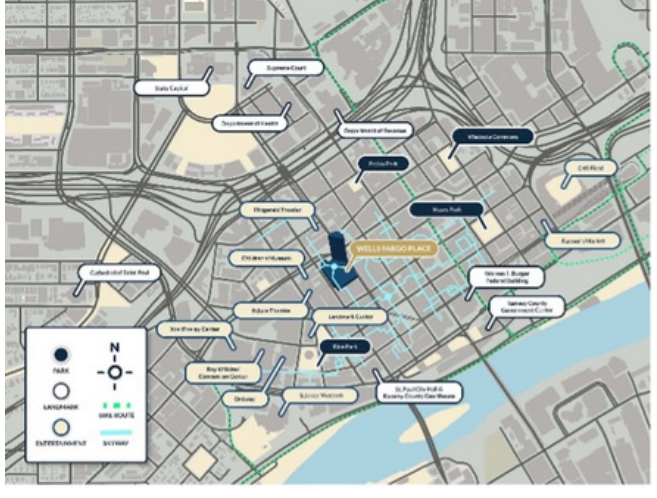
Map of Local Landmarks