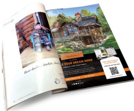
Print Advertisement Designed by SOULO

We have been excited to see our goals — and the goals of Dotty Brothers — drastically exceeded.